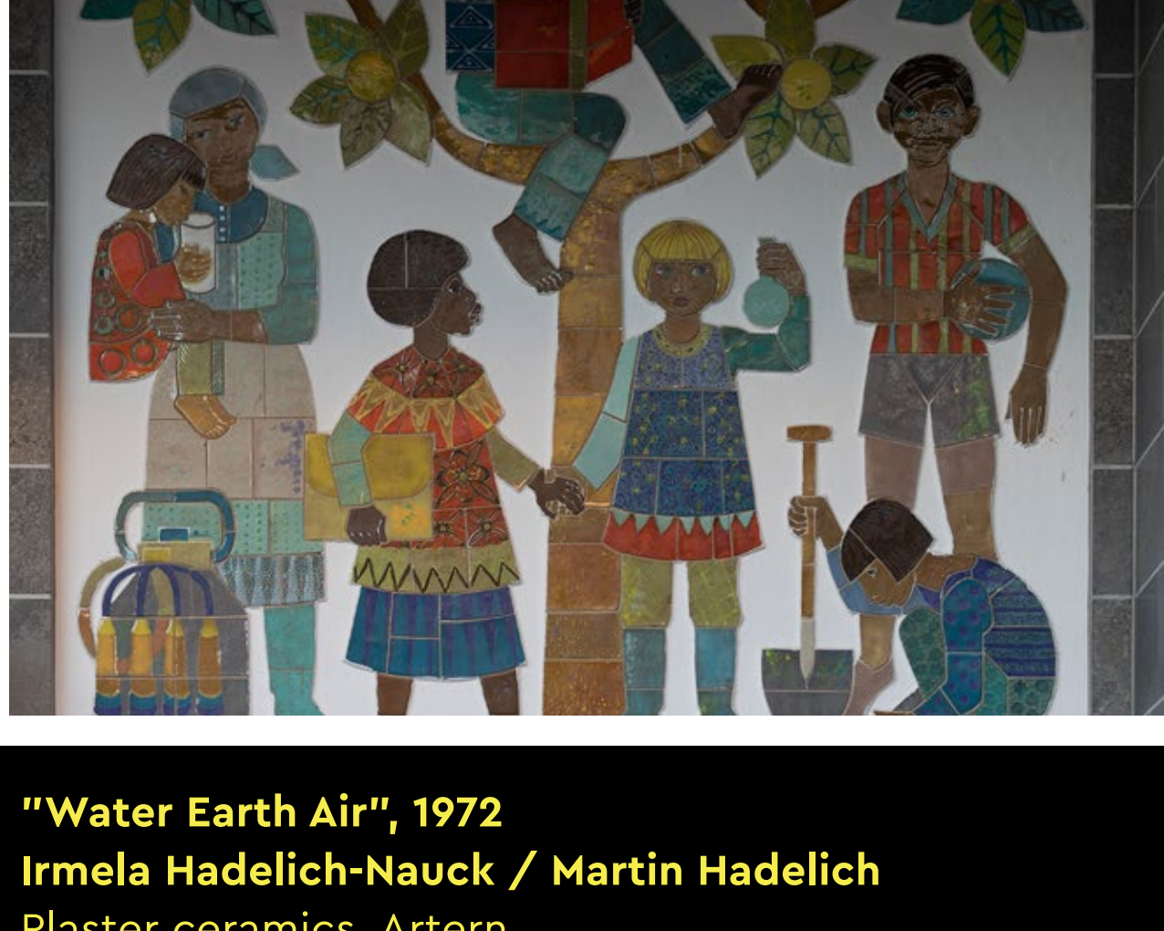
"Water Earth Air", 1972 Irmela Hadelich-Nauck / Martin Hadelich Plaster ceramics, Artern Photo: Norman Hera, 2022

The large-scale ceramic mosaic is now located at the entrance of the district office in the "Straße der Jugend". Until 2018, the building was a school.