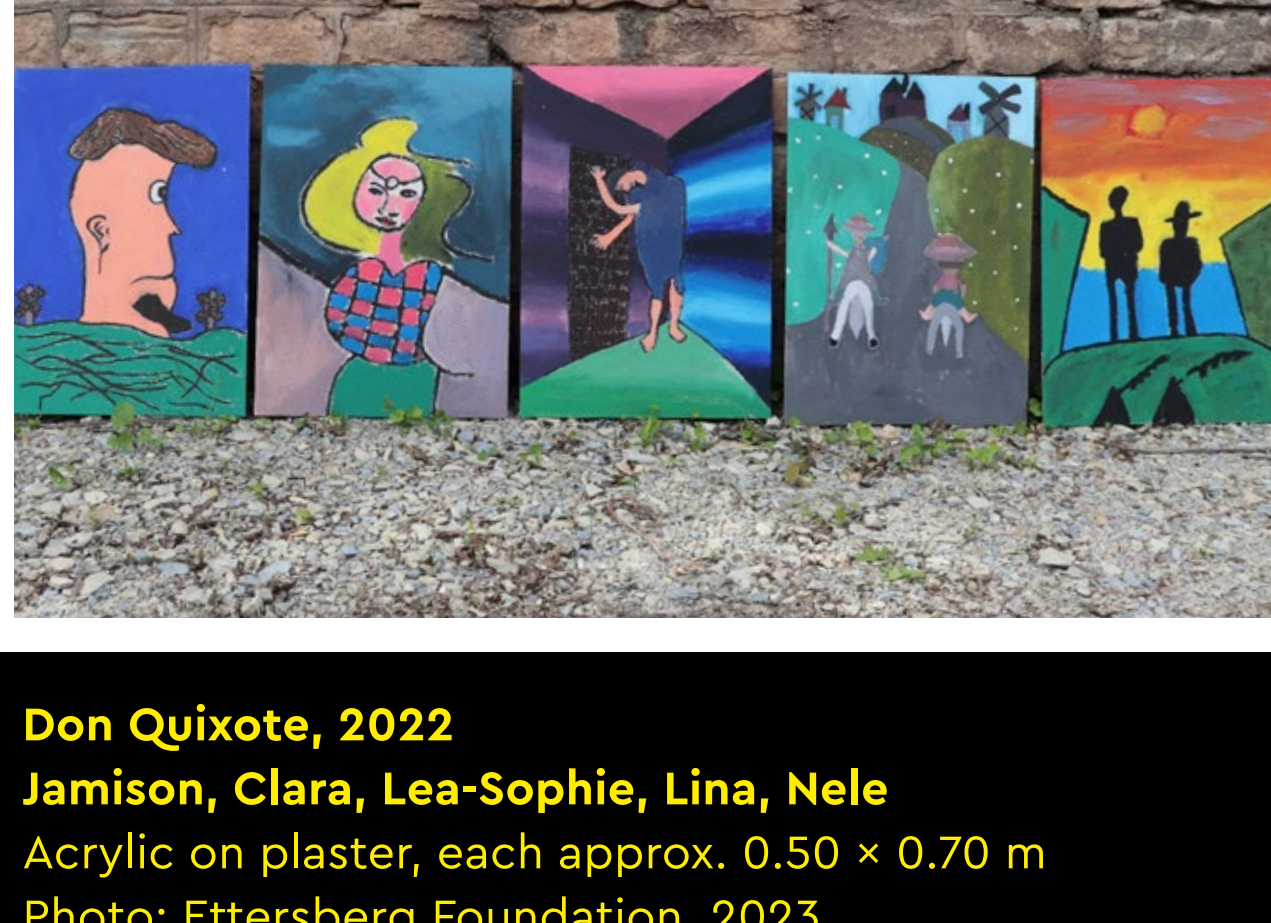
Don Quixote, 2022